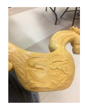
Ale bowls do not all need to look the same.